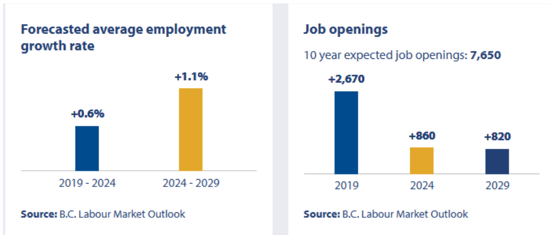
Chart from WorkBC