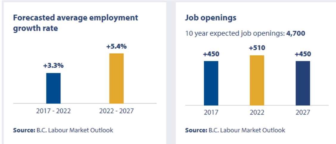
Chart from WorkBC

(Including Financial Planners, Financial investigators, Trust Officers, Mortgage Brokers)