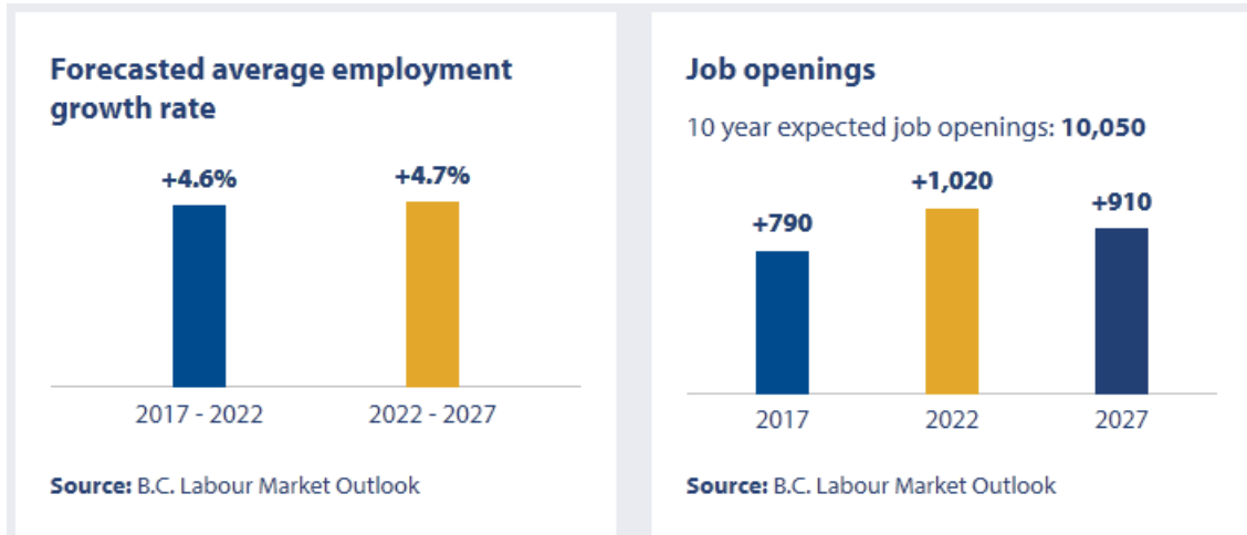
Chart from WorkBC