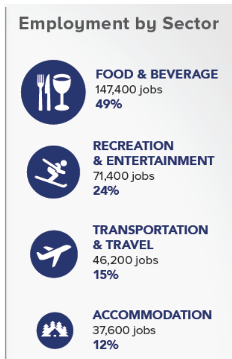
Chart from Provincial Snapshot, BC's Tourism Industry Snapshot, Go2HR https://www.go2hr.ca/wp-content/uploads/2018/10/go2HR-LabourMarketInfographic-PRINT.pdf

There are over 400 occupations in BC's Tourism & Hospitality sector. Over the next decade, you will find thousands of new openings in a wide variety of jobs in the following sectors: