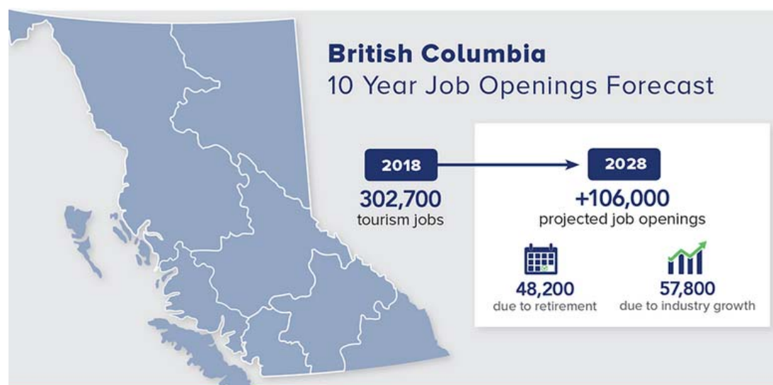
Chart from Go2HR

Tourism is one of British Columbia's fastest growing industries. There are over 19,000 tourism related businesses employing approximately 302,700 workers in BC. It is projected that 106,000 new job openings will be available in tourism by 2028.